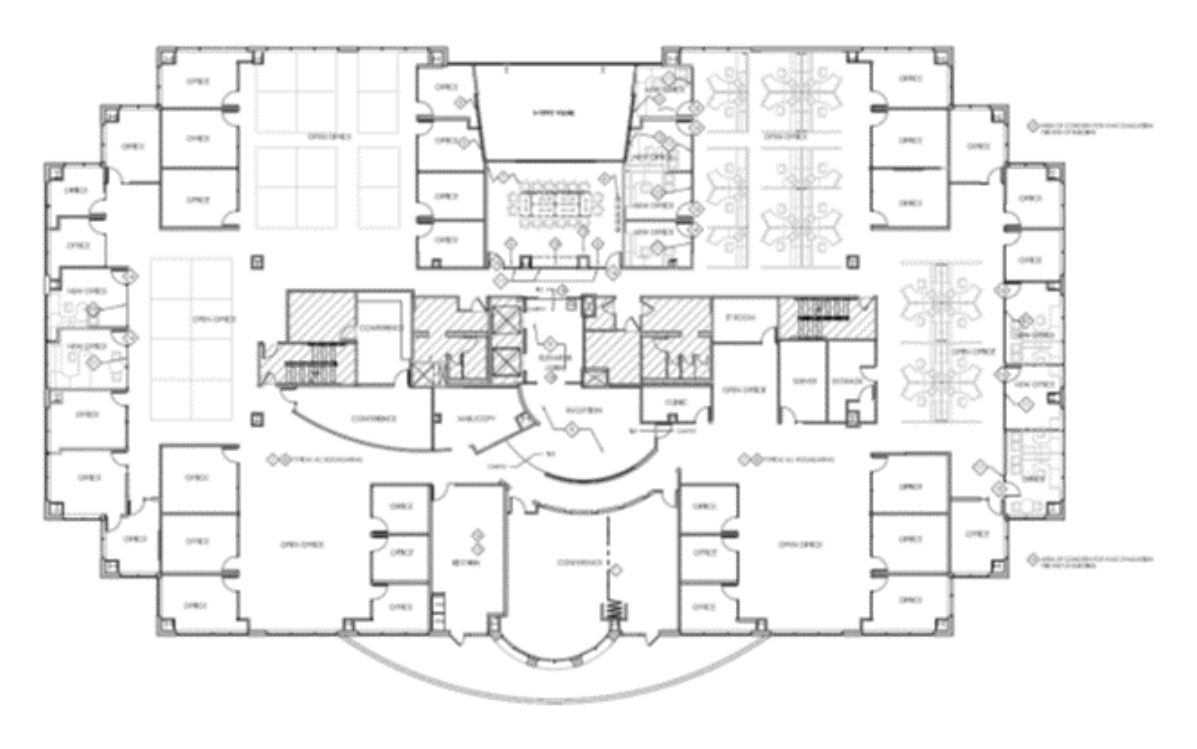
A-1 -- 1